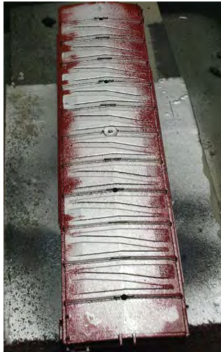
Above: The paper mask applied to the roof of a boxcar prior to painting Right: The painted car demonstrating the nice overspary detail Below: painted roof and the paper mask that created the effect