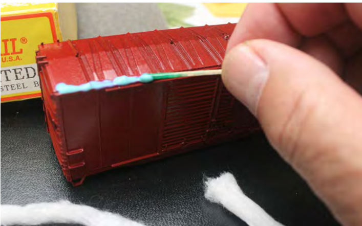
Above: Apply the cotton strips to the EZ Mask along the edges. The idea is to get a feathered effect when the paint is sprayed. Do not forget to mask the entire car