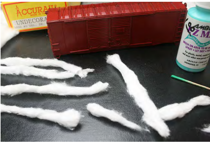
Above: Materials needed: Ambroid EZ Mask and cotton balls cut into very thin strips