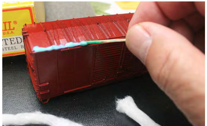
Above: Using a Q-Tip or similar, apply the EZ Mask along the edge of the roof line.