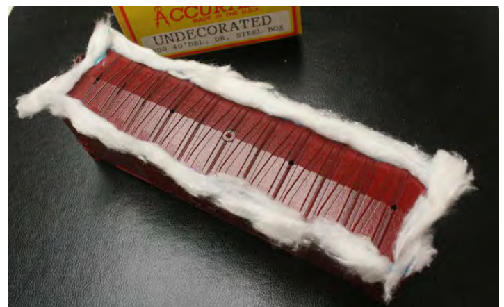
Above: It looks like whiskers, but this photo shows the car complete with the cotton applied.