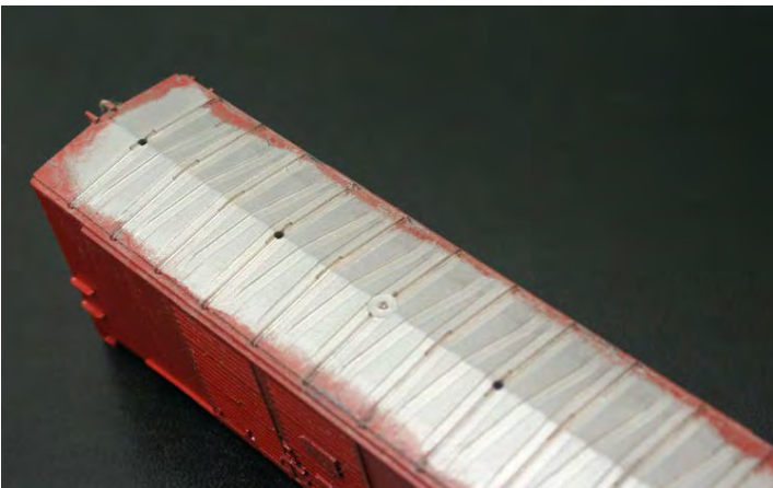
Below: another view of the finished car.