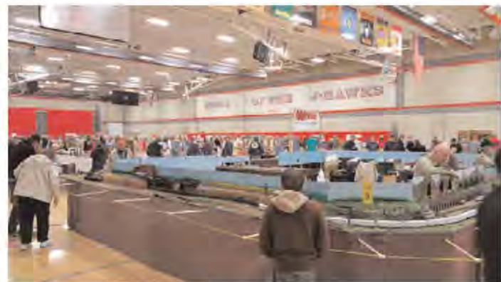
Gary Loiselle and Bert Morris man the check-in table at the 2016 Rockford Train Show (top). The HOTrak modular layout was a popular attraction at this year's Rockford Train Show (center).