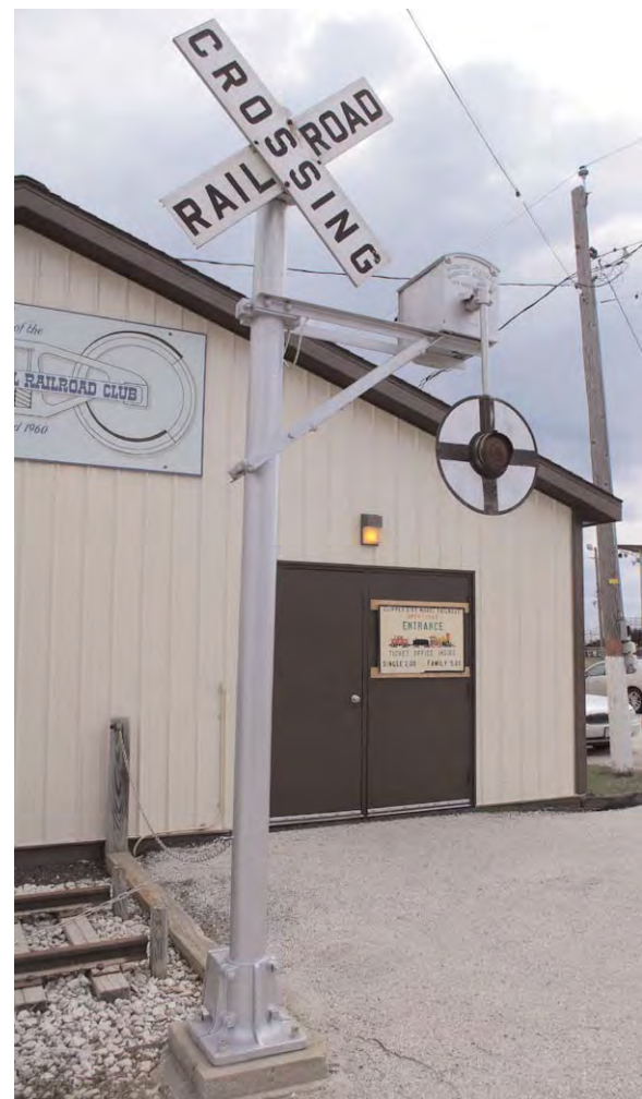
Above The Clipper City Model Railroad club had a nice display outside their door