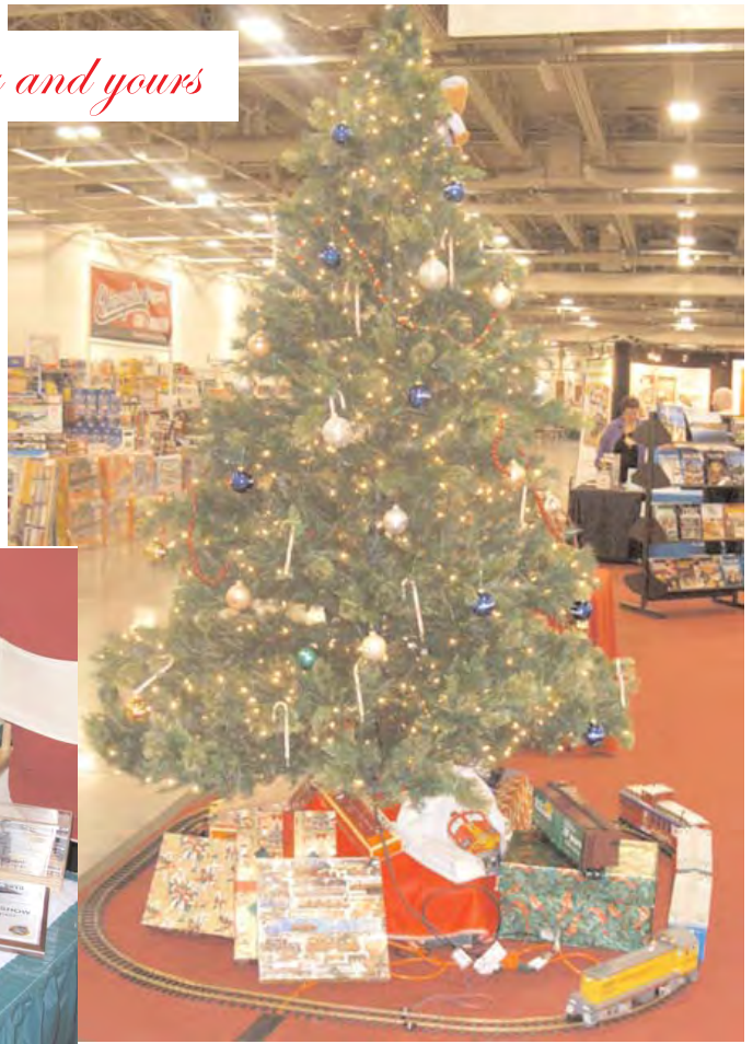
Some shots from Trainfest 2011