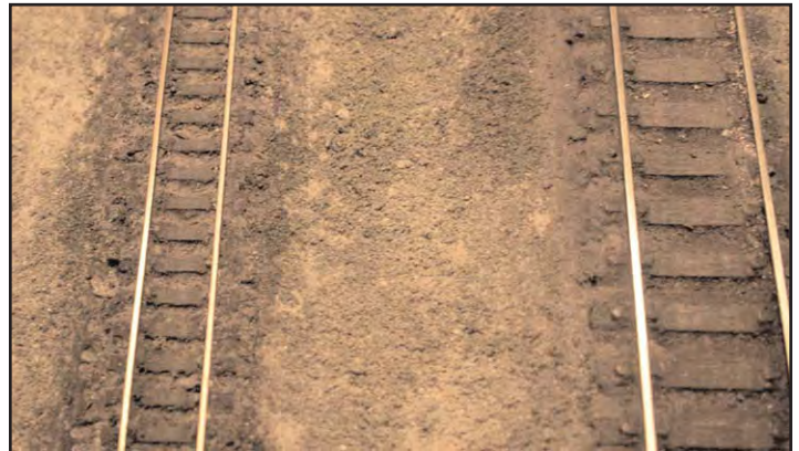
dues or non-dues income. A change was made to candidate nominating procedures. The Nominating Committee must publish its report and recommendations no later than the annual summer Board meeting. Nominations by petition will be accepted no later than 30 days after the publication of the Nominating Committee report, and election timelines will be adjusted accordingly. Allowable length for official statements of candidate qualifications will be 500 words when published in NMRA Magazine, and 1,200 words when published by electronic means.