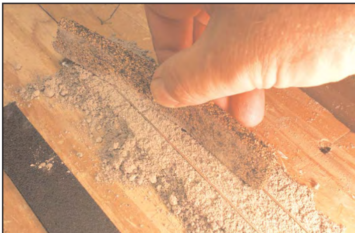
Right: Rolling the track into the adhesive caulk Above: Spreading the ballast (ashes) on the still wet caulk with a scrap of cork roadbed. Below: Spooning more ash (cinders) between the rails

I lay flextrack using latex adhesive caulk, a method outlined by Chuck Hitchcock in the August 2003 Model Railroader. A modest bead of caulk (I use an OSI product that comes out white and dries clear; some modelers have had good results using a gray latex caulk) on the roadbed is smoothed out with a spatula or one of those fake "Your Name Here" credit cards that come in the junk mail. The track is pressed into the thin surface of caulk by hand or using a roller, and with care the caulk rises just below the tops of the ties. At this point you have two options for ballasting: Hitchcock let the caulk set and then applied ballast using matte medium, diluted white glue, or other traditional methods. I have had good success with a refinement of Hitchcock's method: applying at least an initial layer of ballast by applying it directly on the still "wet" caulk, tamping it in place using an old piece of cork roadbed, and lightly spraying it with a water/alcohol mix to make the ballast set into the fresh caulk. The excess ballast is brushed away for reuse when the ballasted caulk has dried. Areas of