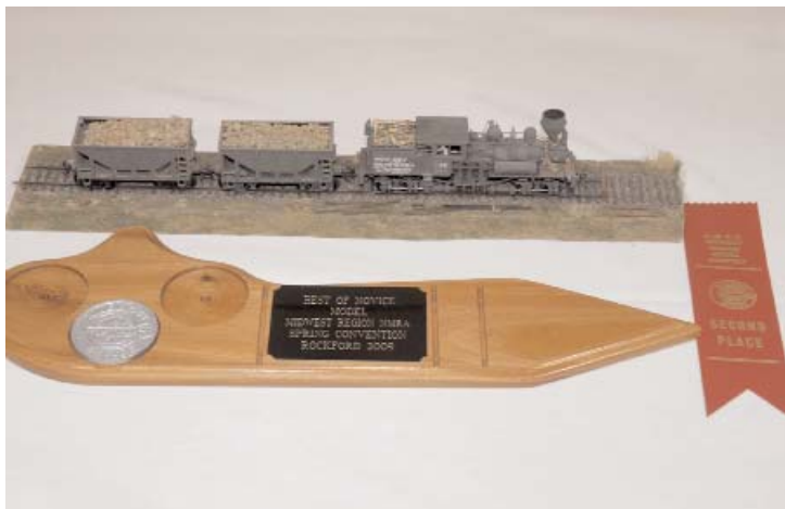
Best of Show-Novice Don Erlandson- two truck Shay and ore cars