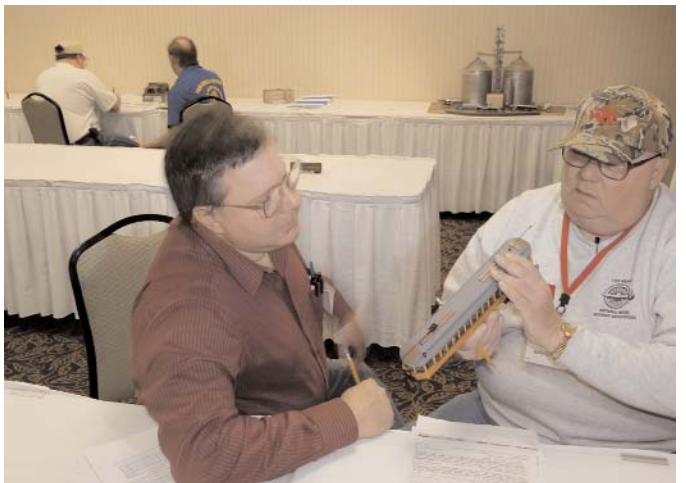
Two judges deliberating over one of the models prior to judging. A critical eye is required.