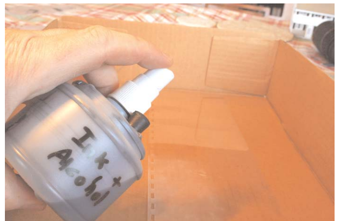
Spray with the India ink mixture.

After blowing or brushing aside loose fragments, the plastic will look frosted but not much like screening. That is where the India ink comes in. In a spray bottle, perhaps also reclaimed from the recycling bin, combine drops of India ink into pure drugstore alcohol. Keep adding drops of the ink until the shaken mixture is as dark as tea; the exact proportions seem not to matter in my experience (various strengths of this India ink/alcohol mix, by the way, are my universal weathering/darkening agent, used on ballast, track, scenery, and trees). Spray evenly. The plastic needs to be plastic perfectly flat so the ink does not puddle. A puddle can be addressed with a cotton swab so have those handy. You may need to blow lightly on the wet ink