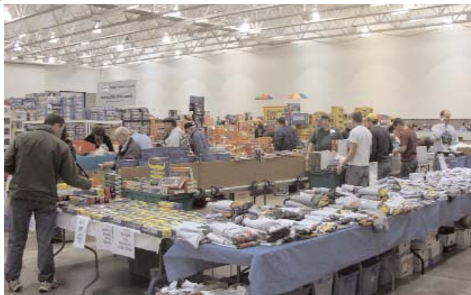
Some of the many vendors at Madison.

pretty good shape until near Madison. In spite of the weather, the South Central Wisconsin Division put on a great show.