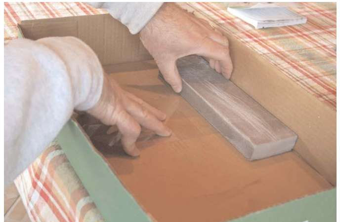
Run the abrasive pad along the sides of the box to ensure you scribe a 90 degree angle.

inside of a box lid works. Turn the piece if that's what it takes to make all motions exactly straight. Make no circular motions; do not vary from long, straight motions in precise 90 degree angles. Be thorough, light, and even in your sanding. The goal is to have a perfect cross hatching effect on the plastic that replicates the regular pattern of genuine screening without individual lines or gouges at odd angles showing.