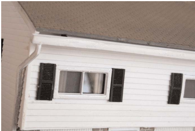
Completed screen installed in the windows. Realistic and easy to do.

This is the first article in a new series, The Frugal Modeler, aimed at helping conserve hobby dollars by using ordinary household items, often stuff we would otherwise toss in the trash or the recycling bin.