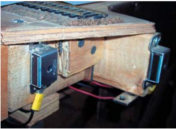
Figure C - Magnets (wired) + L bracket