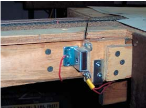
Figure D-Swing Gate – Closed