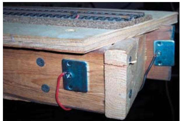
Figure B-Magnet Plates (wired)