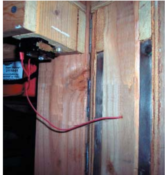
Figure A -micro switch at swing gate