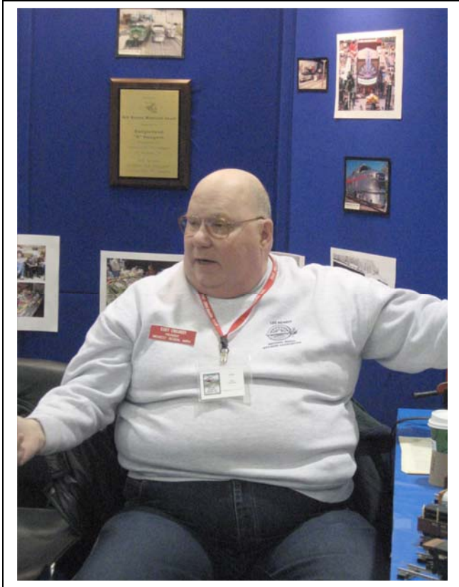
Above: Our region president at his usual best Below: Best of Show – Wisconsin & Michigan Model RR Club